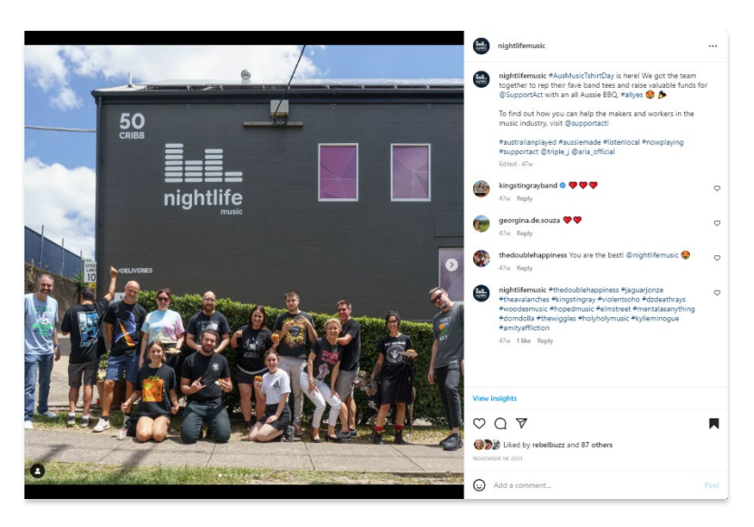
Nightlife Music's post for #ausmusictshirtday2021 [Instagram]

To learn more about Ausmusic T-shirt Day, visit the Support Act website here.