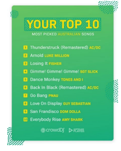
3. Example crowdDJ® Play data from

Contact Nightlife to request your crowdDJ® play data.